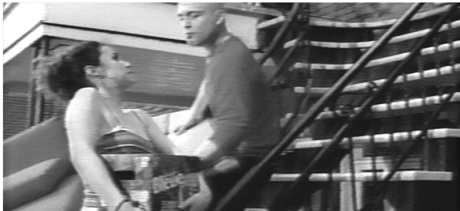
THE MOVING-DAY RITUAL

NOTE.—This image is from a Labatt Blue TV commercial that aired in 2000. The scene takes place on a staircase somewhere in Montreal. A man is moving with the help of his friends. They carry a sofa bed down the stairs while a woman brings up a case of beer. The ad emphasizes the sociality of the moving-day ritual and the festive character of the event.