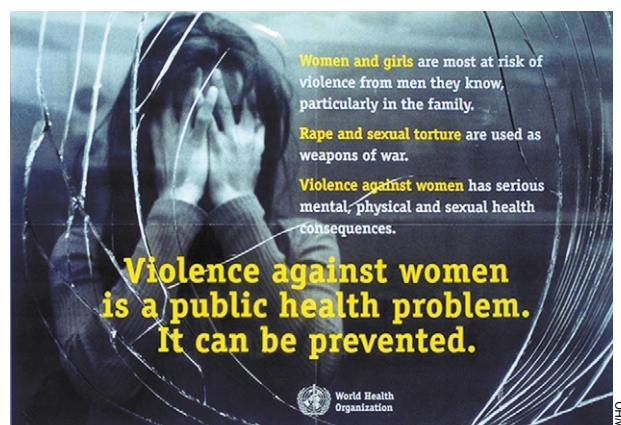
Figure 3: WHO poster highlighting mental effects of abuse

Analysis of the relations between partner abuse, health status, and use of medical care in women in population-based and clinical studies has shown poorer overall mental and physical health, more injuries, and more consumption of medical care including prescriptions and admissions to hospital in abused than non-abused women. 5-7,22 In a Canadian population-based study, 2 battered women sought care from accident and emergency departments and saw a medical professional about 3 times more often than non-battered women. Furthermore, strong evidence suggests that use of medical services increases with the severity of physical assault. 5 Several estimates have been made of the health-care costs of intimate partner violence, but only a few rigorous cost analyses have been done. In a well designed comparison of health plans, battered women generated around 92% more costs per year than non-battered women, with mental-health services accounting for most of the increased costs. 7