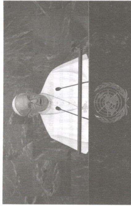
13. Pope Francis I addresses the UN General Assembly on climate change, 25 September 2015.

But perhaps the most influential recent attempt to raise people's consciousness about the dangers of climate change came from an unexpected quarter: the Vatican in Rome. In September 2015, Pope Francis I stood before the UN General Assembly and issued a radical call for the world to address global warming (see Illustration 13). Connecting the issue of climate change to the wider pursuit of equality, security, and social justice, the pontiff went so far as to send his shoes to the 2015 UNIPCC Climate Summit in Paris, to be displayed at the city's Place de la République together with thousands of shoes of other climate-change protesters as a public symbol to curb carbon emissions (see Box 7).