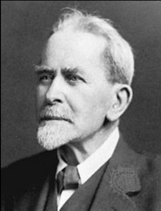
James George Frazer [1854-1951]