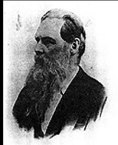
Edward B. Tylor [1832-1917]