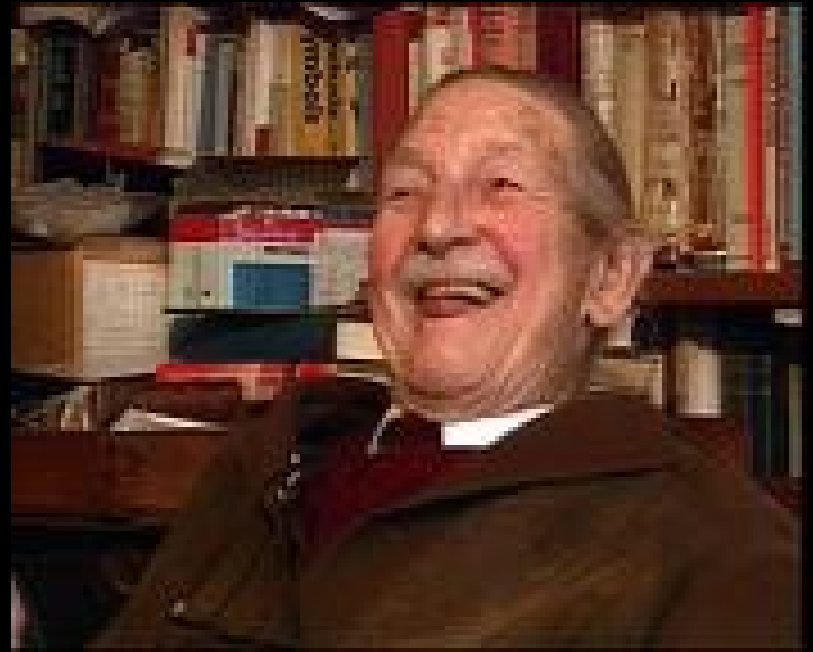
Raymond Firth, (1901 - 2002)