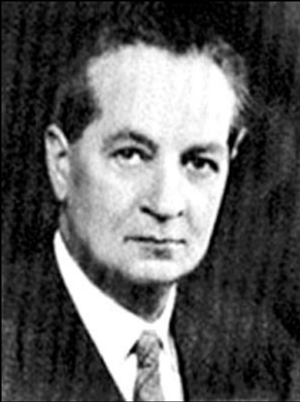
• Alfred Reginald Radcliffe-Brown • (1881 - 1955)