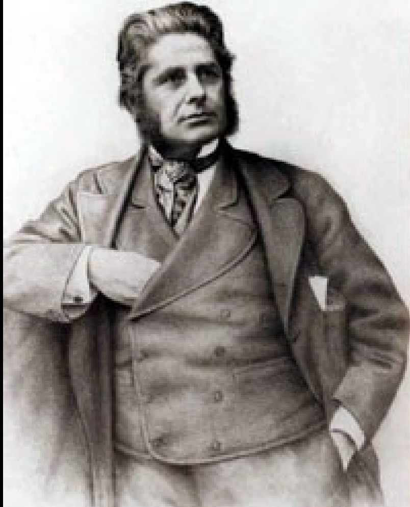
Lieutenant General Augustus Henry Lane-Fox Pitt-Rivers [1827-1900]