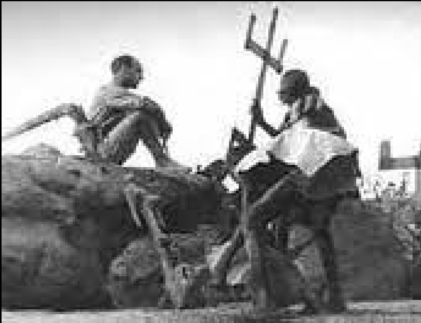
Marcel Griaule amongst the Dogon of West Africa