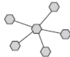
Star or hub network