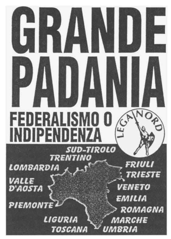
Figure 1 The Lega Nord's geographical representation of the boundaries of 'Padania', taken from the party's 1996 National election campaign

the Lega Nord maybe the first authentic post-modernist territorial political movement in its self-conscious manipulation of territorial imagery to create a sense of cultural/economic difference with an existing state of which it is part. (Agnew and Brusa 1999, 123)