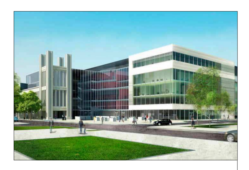
FIGURE 2: SOLARIS KESKUS VISUALISATION, 2010 (ARCH. RAIVO PUUSEPP) (SOURCE: WWW.PUUSEPP. EE/?PORTFOLIO=2010-SOLARIS-SHOPPING-CENTRE)

management, we have been asking ourselves how we are to depict and juxtapose our feelings of outdoor public space, grocery store, atrium, staircases, cinemas, stores, parking lots and the building's rooftop. How are we to deal with employees and visitors, including ourselves? How could camera framing and the workings of microphones "fit" together? Observing ceilings with kilometers of exposed water tubes, or sitting in the THX-certified silence of the cinema hall, we have been puzzled by questions about what it is that we are looking at and what it is that we are listening to in this project. In other words, thinking as filmmaking storytellers and following a structuralist rationale, the pressing issue we found ourselves captivated by was how the sensorial glimpses of a gloaming mall can come together, transcending the chaos of sensations into a progressively evolving series of situations – a narrative, "a semiotic phenomenon that transcends disciplines and media" (Herman et al. 2005: 344). In other words, what's the story that we want to make about? As I elaborate later, such an initial reaction did not serve the framework with which we started.