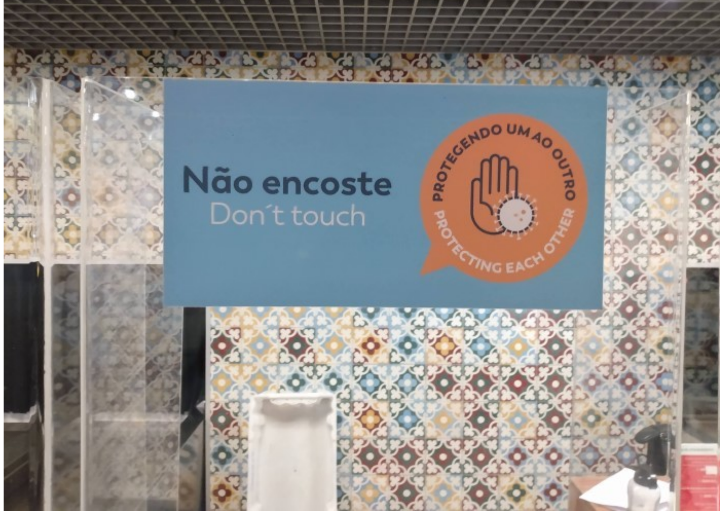
Paride Bollettin, The visual presence of Covid in Airports, Anthropologicas Visual , 2021