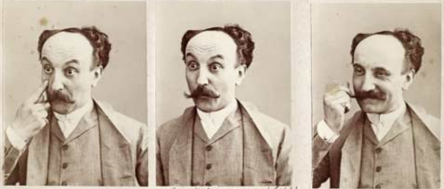
De gradi de corpore sereno / delgado.