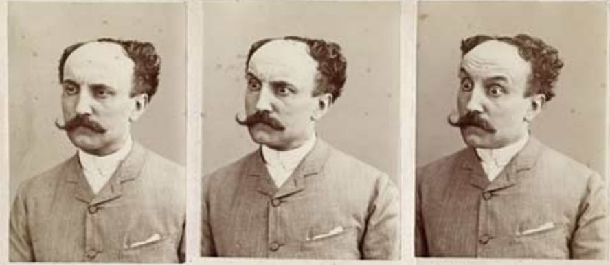
De gradi della collera aperti nell'istato delgado.