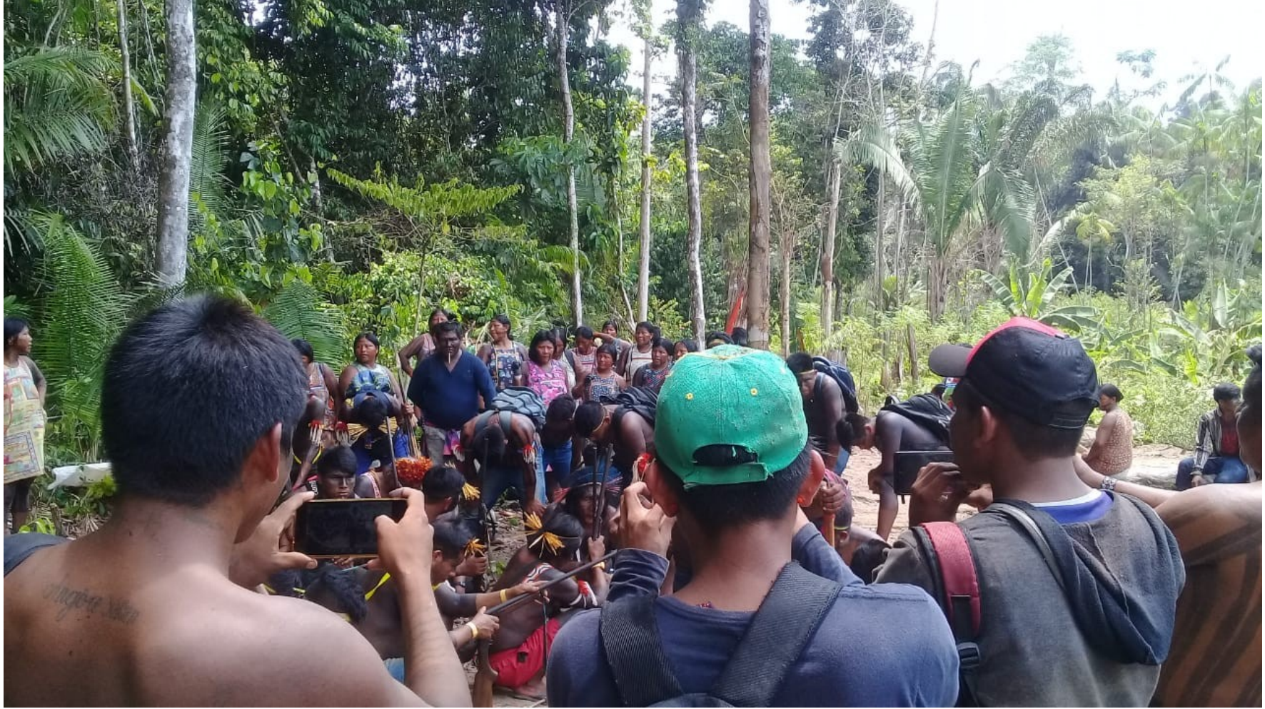
Bekwy Xikrin and Bollettin Paride (2022 Visual Ethnography ) From The re-appropriation of the Trincheira-Bacaja Indigenous Land