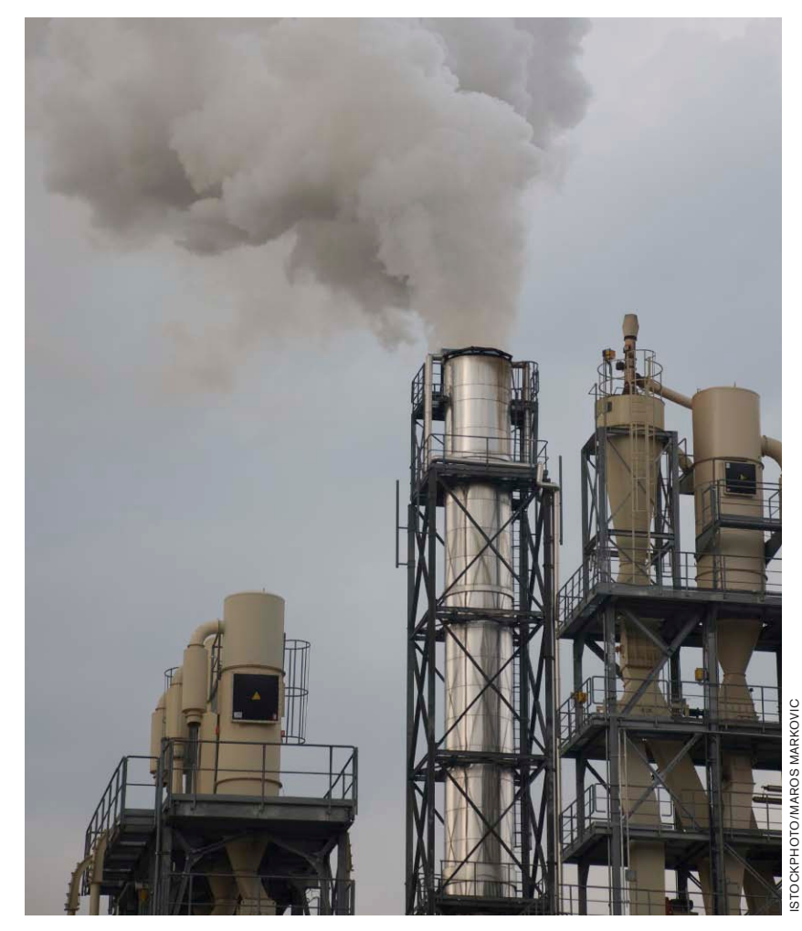
Some scientists have proposed carbon dioxide removal systems to address pollutants emitted by refineries such as this one.

evident, a significant proportion of participants offered a "reluctant acceptance"-that is, they agreed that nuclear power (as a potential source of low-carbon energy) could be a necessary evil in the fight against climate change.22 A key conclusion of the research was that this was a conditional, unstable attitude position with considerable ambivalence associated with the apparent support. In addition, participants in qualitative discussion groups expressed resistance to the pre-framing of 'nuclear vs. climate change' rather than 'nuclear vs. other energy options that might fight climate change'. Geoengineering is being advocated in precisely this way-as the lesser of two evils. If a narrative of inevitability is used to frame geoengineering without fully evaluating its merits against other policy options first, what effect will this have on public acceptance of it?<sup>23</sup>