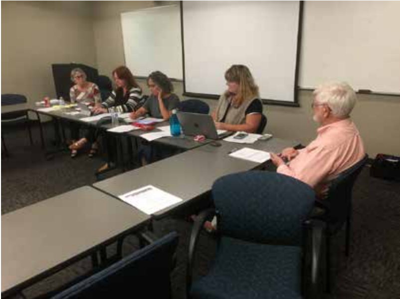
Figure 2.5. California Citizens Redistricting Commission Committee Meeting, 2017. Some members participated by telephone (photo: October 27, 2017, Sacramento, CA; author).

pick six more from the pool, two from each party and declined-to-state. These fourteen serve for a ten-year term, and their work is supported in line-drawing years by a staff of fourteen full-time employees. The CRC is funded by a legislative appropriation, and in nonline-drawing years has a budget of $93,000 for the fiscal year 2017–2018. 36