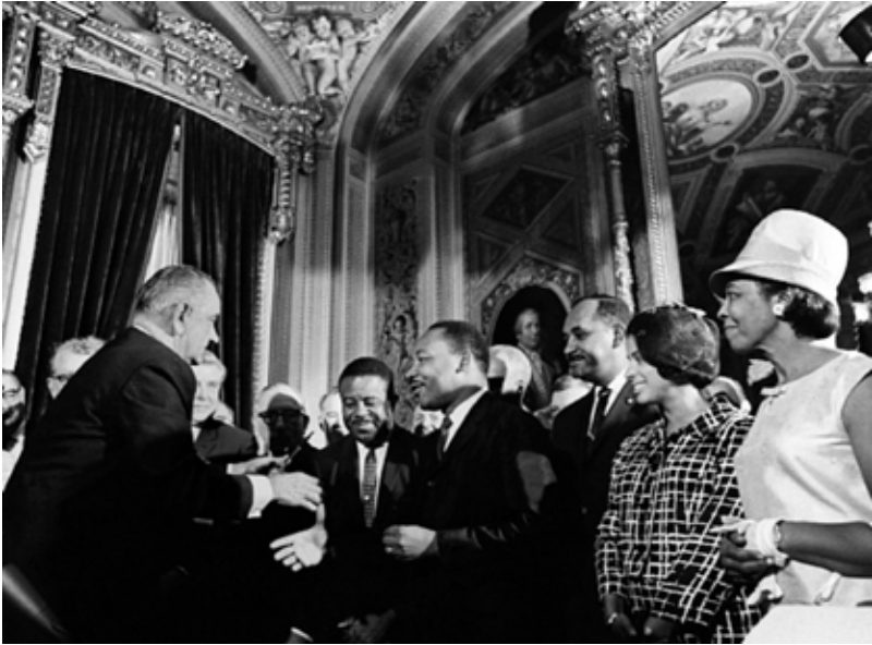
Figure 2.4. President Lyndon Johnson celebrates with Rosa Parks, Martin Luther King, Jr., Ralph Abernathy, and other civil rights leaders after signing the 1965 Voting Rights Act into law. The law was immediately hailed as a “triumph for freedom.” It authorizes the Department of Justice to remedy violations of the Fifteenth Amendment of the Constitution, which prohibits the denial of the right to vote “on account of race, color, or condition of previous servitude” (photo: August 6, 1965, Washington, DC; CORBIS/Corbis via Getty Images).

After repealing the voting rights of the Fifteenth Amendment, Section 2, the act, in Section 5, gave special enforcement powers to the Department of Justice in those areas where voter discrimination appeared to be the greatest.