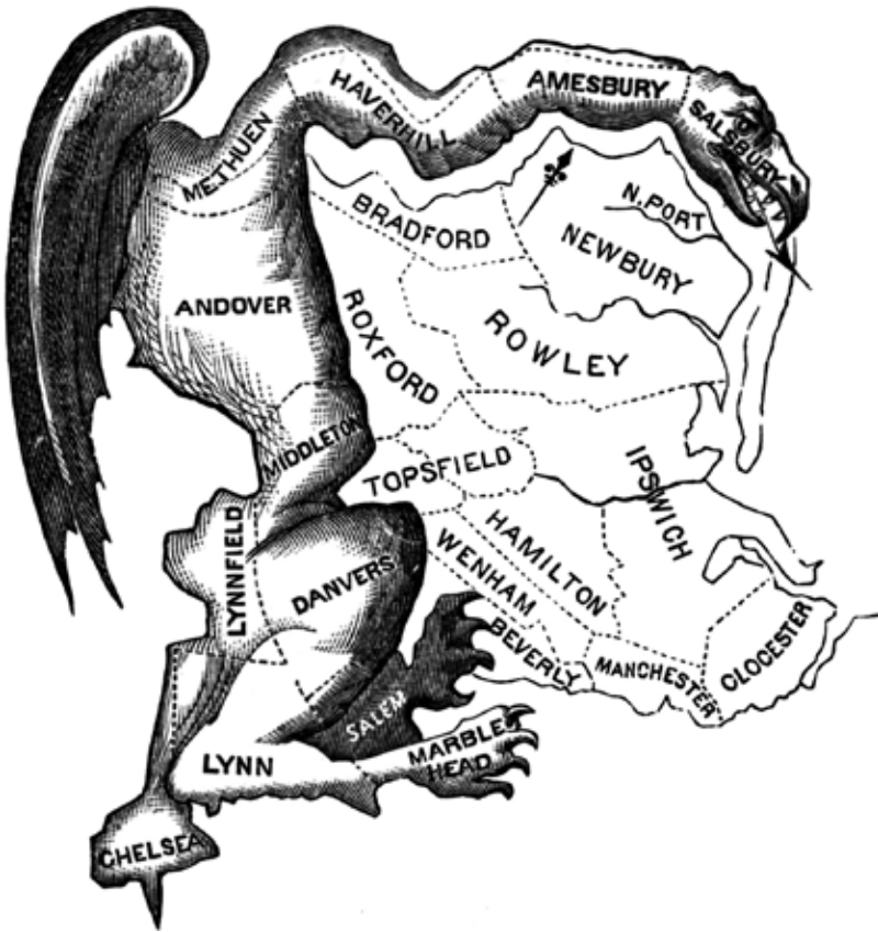
Figure 2.1. Elkanah Tisdale, "The Gerry-Mander," Boston Gazette , March 26, 1812

bers, while the rest of the state, with a voting population of more than 111,000, elected only seventeen senators and fifty-four representatives. 4