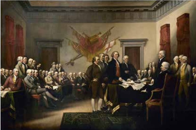
Figure 2.2. John Trumbull, Declaration of Independence, 1819, is a monumental (12 × 18 ft.) oil painting in the US Capitol rotunda. It shows the moment on June 28, 1776, when the first draft of the declaration was presented to the Second Continental Congress meeting in Philadelphia in what is now known as Independence Hall. Trumbull made most of the portraits from life. Elbridge Gerry is the fourth in the group of ten seated figures at the far right of the painting. Later Gerry would refuse to sign the Constitution. He believed it gave the executive branch too much power.

Independence, 7 attended the Constitutional Convention of 1787, served as governor of his state, and was vice president while James Madison was president.