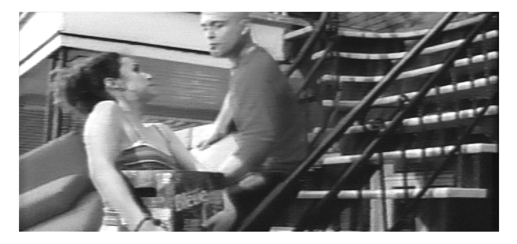
FIGURE 1 THE MOVING-DAY RITUAL

Note.—This image is from a Labatt Blue TV commercial that aired in 2000. The scene takes place on a staircase somewhere in Montreal. A man is moving with the help of his friends. They carry a sofa bed down the stairs while a woman brings up a case of beer. The ad emphasizes the sociality of the moving-day ritual and the festive character of the event.