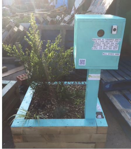
Figure 1. Box and planter.