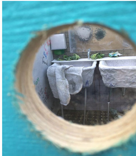
Figure 2. View inside.

how and by whom the footage would be edited and how and by whom the final film would be used or shared, something that reflected the fact that the project team were learning on the go (Gubrium et al., 2015). Furthermore, at the time, the PARTISPACE European consortium had not reached an agreement about how confidentiality or anonymity would be maintained and on what basis the films would be made publicly available. Thus, the project team deliberately focused on the film as a way of documenting the creation of the art installations and the walking tours rather than as a shared output.