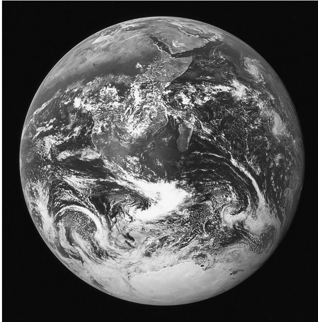
FIGURE 1 The Blue Marble , view of the Earth from Apollo 17 (1972).

such as habitat loss, soil degradation, and biodiversity loss. It has also led to the doubling of nitrogen flows through industrial fixation (as a result of the Haber–Bosch process) and the tripling of phosphorus flows (benefitting from massive industrial, fossil fuel-based mining efforts). The proximate result of increasing the amount of these typically limiting nutrients expands food supply, but the production of both nitrogen and phosphorus is highly fossil fuel-intensive creating energy supply dependencies. Furthermore, excess nitrogen and phosphorus that runs off agricultural fields creates massive eutrophication problems that are evident in almost every heavily populated estuary and water body in the world. Agricultural production to meet the world’s needs is also responsible for rapid groundwater withdrawals, pesticide applications, and abundant greenhouse gas emissions at numerous stages from the fossil fuel use, to soil alterations, to methane from rice and livestock production. So, while the verdict is not in regarding absolute constraint of food production on human population growth, it does appear clear that we are in fact not feeding the people of the planet in a sustainable manner, nor whether it is even possible to do so at this scale. Malthus’ concerns should not be dismissed lightly.