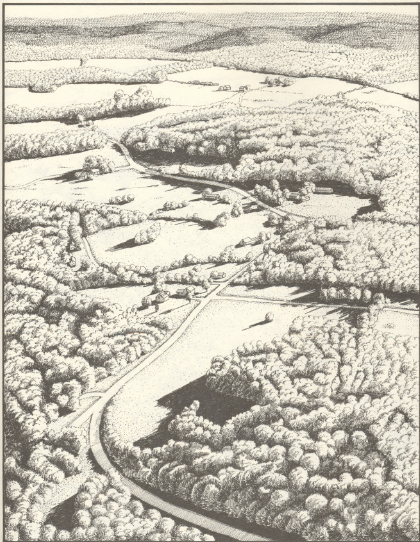
A TYPICAL NEW ENGLAND LANDSCAPE