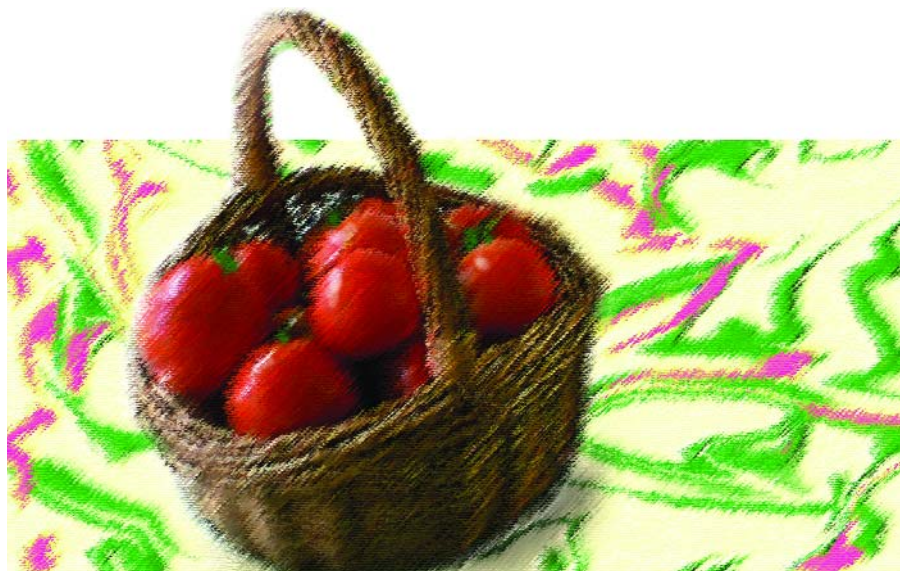
Even something as small as the decision by a therapist to accept or decline a gift of homegrown tomatoes can influence the way the relationship develops

Consider these micro-examples, all taken from my own experience. A woman whose husband committed suicide breaks into uncontrollable sobbing. I feel uncomfortable leaving her to cry without making some attempt to console her. A man, who is very acerbic in his manner, ridicules all my therapeutic comments as 'typical rubbish that psychologists spout', making me feel angry and frustrated. A woman, experienced in psychotherapy, comes in with a gift of homegrown tomatoes to thank me for my help and is furious when I politely decline the gift. A man, starting a course of exploratory psychotherapy, wants me to start the session off, claiming the silence at the beginning is persecutory. A man writes me a heartfelt letter wondering if he is depressed and wanting to know more about