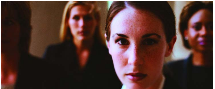
People do not have depression or anxiety or schizophrenia like they have measles or diabetes or heart disease

This uncomfortable fact opens up a huge black hole for outcome research into psychotherapy. For if one cannot validly categorise experiences as illnesses, how can we generalise what we find in any research study? If so-called symptoms spread across diagnostic categories like spilled ink flowing over paper, how do we reliably differentiate between conditions? If psychological problems are not treatable like medical ones, what sense does it make