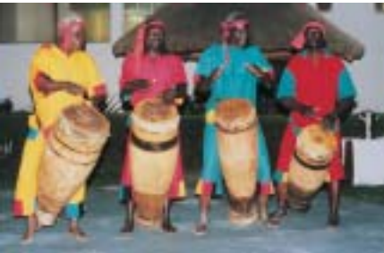
The Zambian National Dance Troupe

There is an important relationship between IP 'protection' and 'preservation/safeguarding' in the cultural heritage context. For example, the very process of preservation (such as the recording or documentation and publication of traditional cultural materials) can trigger concerns about lack of IP protection and can run the risk of unintentionally placing TCEs in the 'public domain'; thus leaving others free to use them against the wishes of the original community. Or, unless handled carefully, it can mean that the person recording the traditional expression gains copyright over the form in which it is recorded (e.g. a photograph, film or sound recording of a TCE).