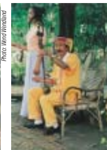
Traditional artisans and performers, Yunnan Province, China

With regard to these kinds of examples, three approaches among indigenous and local communities were identified during the fact-finding missions and consultations conducted by WIPO since 1998: