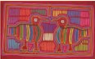
A 'mola' from Panama

Under the Pacific Regional Framework for the Protection of Traditional Knowledge and Expressions of Culture, 2002 , 'traditional owners' have the right to authorize or prevent, amongst others, the adaptation, transformation and modification of the protected TCEs. An external user must receive consent to make new derivative works (works based upon a TCE). Any IP rights in derivative works vest in the work's author. However, if the work is used for commercial purposes, the rights-holder must share benefits with the traditional owners, acknowledge the source of the TCEs and respect moral rights in the TCEs.