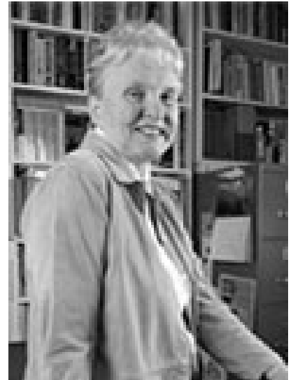
Carolyn Merchant 1936 -