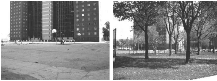
Figure 1: Attrition Has Left Some Buildings Surrounded Almost Entirely by Concrete and Asphalt and Others With Pockets of Green