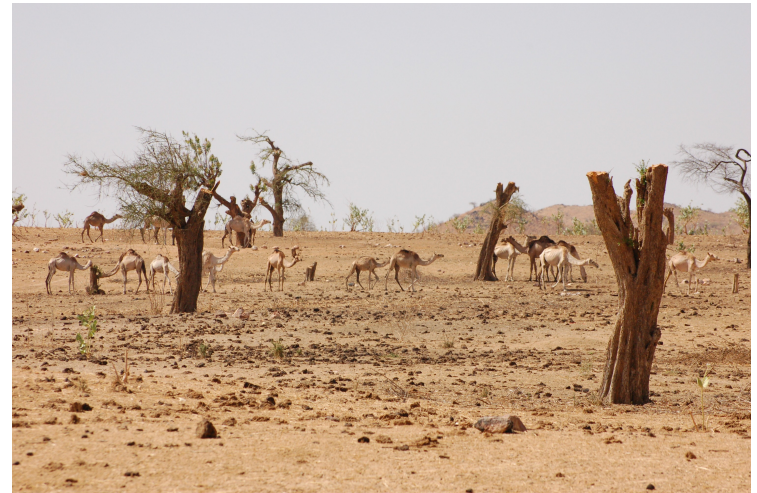
Camels graze in a destroyed village in Western Darfur