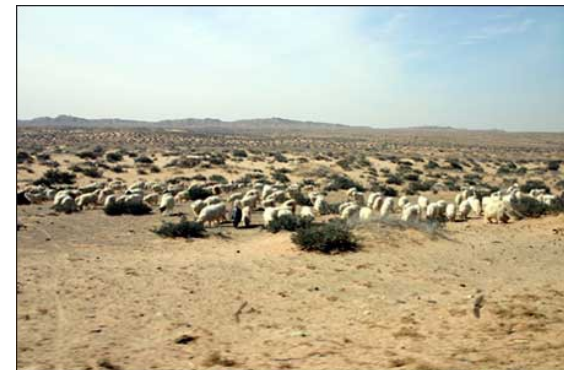
Overgrazing in Alxa League, western Inner Mongolia (source: http://www.adb.org )

© Ron Leishman * www.ClipartOf.com/1047837