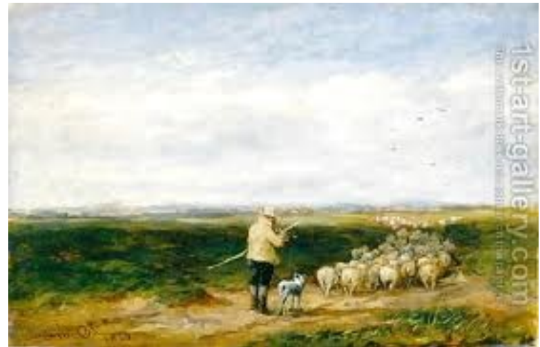
David Cox 'The Shepherd, Return of the Flock'