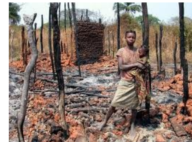
Poverty in the Congo