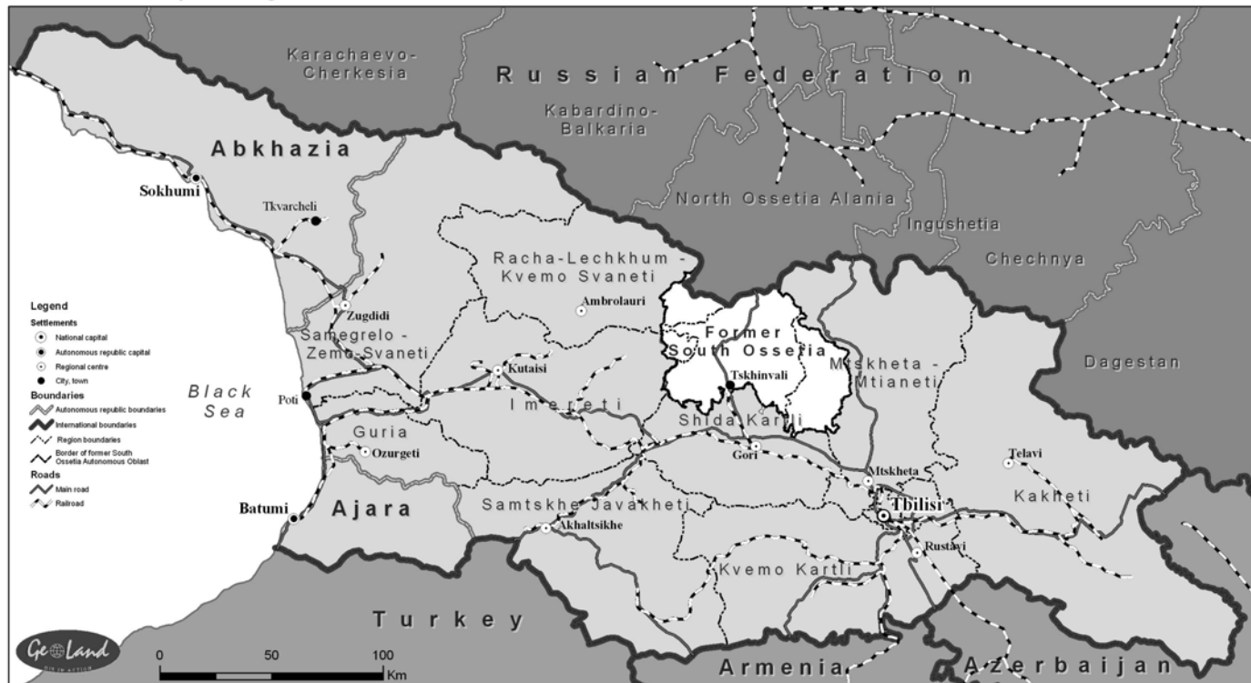
Administrative map of Georgia