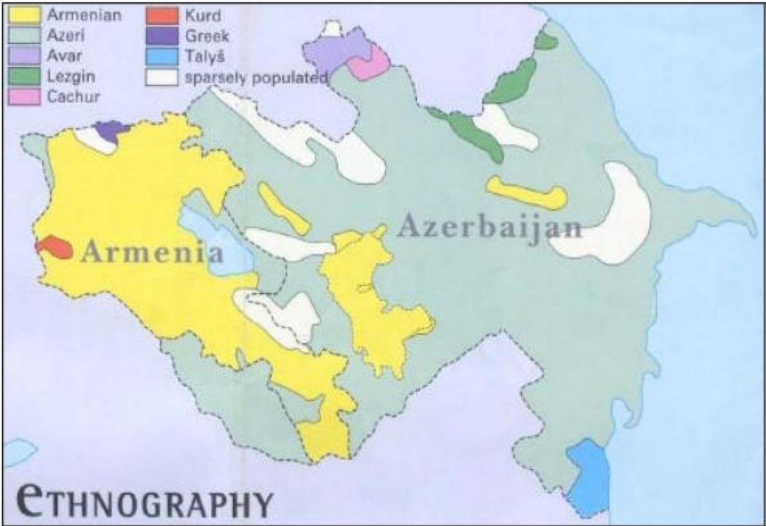
Map 3: Ethnic Settlement Patterns in Armenia and Azerbaijan, 1989