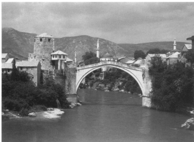
Fig. 2. The Old Bridge at Mostar in 1974, before its destruction in 1993.