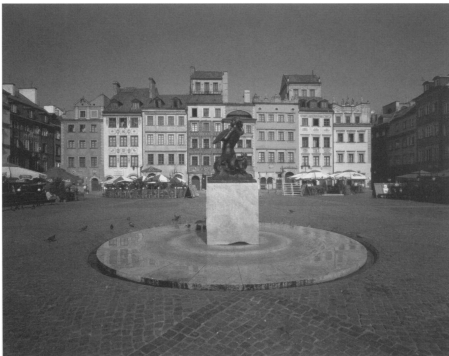
Fig. 1. Reconstruction of the historic center of Warsaw.

In the first version of the Operational Guidelines (1977), authenticity is one of the qualities a cultural property must have in order to qualify as a World Heritage Site. The so-called "test of authenticity" defines the concept as