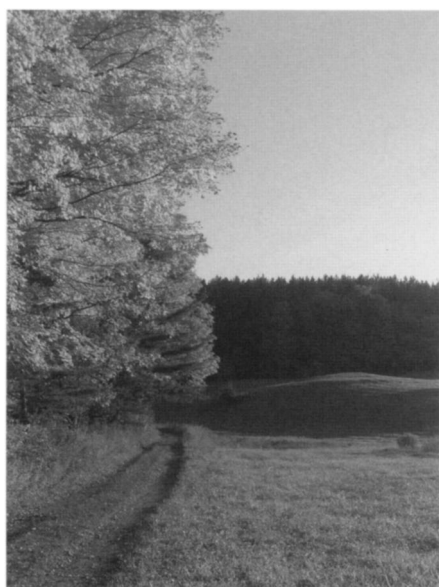
Fig. 1. The patchwork of Mount Tom's forest represents an evolution in land use. This hay field is one of the agricultural fields that date back to the early 1800s. The trees in the foreground are an alley of sugar maples, which line a former farm road that is part of the 20-mile carriage-road system developed by Frederick Billings. In the background a 1952 stand of red pines represents one of the youngest plantations on Mount Tom.

New directions in authenticity of cultural landscapes offer important opportunities to connect historic preservation with the sustainability movement and renew successive generations' commitments to stewardship of these places of heritage.