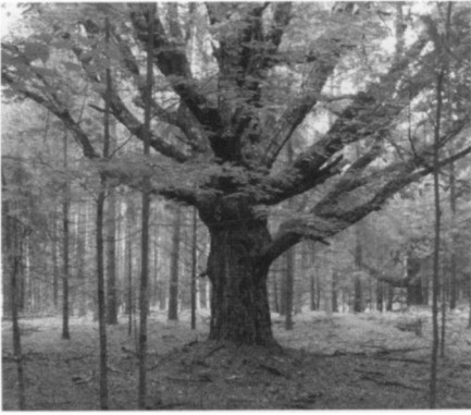
Fig. 2. The wide-spreading character of the branches of this nearly two-century-old sugar maple legacy tree is a testament to the open, agricultural origins of this area, which is now a dense red-pine plantation dating from the 1950s.

integrity and/or authenticity of the property.” 19