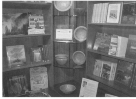
Fig. 5. The Marsh-Billings-Rockefeller National Historical Park Visitor Center bookstore, operated by Eastern National, has products made by local artists from wood harvested in the park and books covering many aspects of conservation.