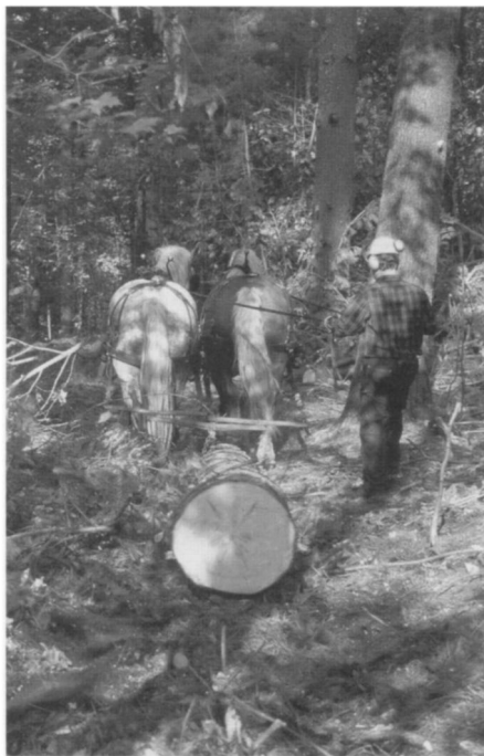
Fig. 3. At Marsh-Billings-Rockefeller National Historical Park single-tree harvesting using horses illustrates one example of low-impact forestry methods that can be used successfully by landowners.

Management strategy. The authenticity of this property is conveyed by both tangible resources in the dynamic character of the forest and intangible values. Therefore, the park identified two key challenges that needed to be addressed in the management strategy in order to retain the property's authenticity over time: