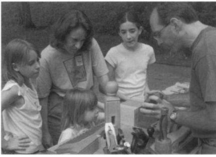
Fig. 4. A local furniture maker demonstrates the art of his craft at the park while also discussing how local, sustainably managed forests inspire and support the tradition of regional wood-product craftsmanship and his own work.