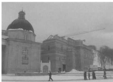
Fig. 7. The reconstruction of buildings that could act as symbols of newfound national identity was a common tendency in the former republics of the Soviet Union, as here with the reconstructed Palace of the Grand Duke in the World Heritage city in Vilnius, Lithuania, in 2003. While an argument could be made for the reconstruction of Blackhead's House on a site vacant since World War II (see Fig. 6), the reconstruction of the Vilnius Palace is more questionable: the reconstruction was achieved at the expense of portions of a 200-year-old Russian barracks, and the facades of the reconstructed palace were based on very limited iconographic evidence.

the Baltic region, including Greece, where it has been used in assessing reconstruction strategies for the Parthenon, and in the UK, where it has been accepted as a key document underlying the English Heritage Policy Statement on Restoration, Reconstruction and Speculative Recreation of Archaeological Sites including Ruins (Figs. 6 and 7). 30 This Policy Statement notes that participants at a regional meeting in Eastern Europe agreed that the Riga Charter “has wider application....and that the Charter re-establishes the presumption against reconstruction except in very special circumstances and reiterates that it must in no way be speculative.” 31