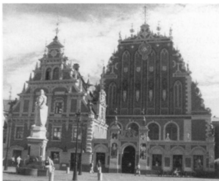
Fig. 6. The late 1990s reconstruction of Blackhead's House, in the World Heritage site of Riga, Latvia, on a prominent site in the town's central square, helped shape discussions that led to the adoption of the Riga Charter, establishing the limits and conditions within which such reconstructions should be considered appropriate in conservation frameworks.

together 100 experts from Eastern Europe and resulting in the Riga Charter on Authenticity and Historical Reconstruction in Relationship to Cultural Heritage).