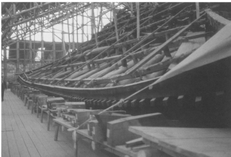
Fig. 2. In fearing that World Heritage nominations would be judged within Eurocentric frameworks, the Japanese were also concerned that existing widespread conservation practices — such as the top-to-bottom periodic dismantling and reassembly of significant religious structures — would also not be understood by Western evaluators. Photograph by the author, 1993, © ICCROM.

culturally imbedded) conservation practices by recognizing that