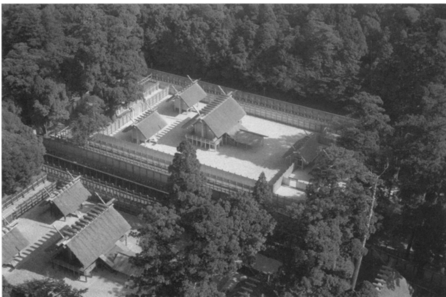
Fig. 1. One of the sources of the Nara meeting was the feeling of Japanese conservation professionals that their approaches to conservation were misunderstood. The example most cited was the false contention in many Western publications that the Japanese ritually rebuilt replicas of their temples on adjacent sites every twenty years — a practice in fact limited in modern times to one Shinto shrine, the Ise Shrine, seen here.

The originators of the Nara meeting had more prosaic benefits in mind, however. They wished simply to extend the range of attributes through which authenticity might be recognized in order to accommodate within it mainstream Japanese conservation practices — namely the periodic dismantling, repair, and reassembly of wooden temples — so that Japan would feel more comfortable about submitting World Heritage nominations for international review (Figs. 1 and 2). 1 This aim was accomplished by returning to a framework more closely in tune with the framework from which the World Heritage test of authenticity had originally emerged (including the integrity requirement, which had underlain analysis of historic properties for inclusion on the National Register of Historic Places in the United States) and its inclusion of dynamic, or process-based, attributes. 2 While the Nara meeting did produce a more broadly drawn technical framework for authenticity analysis, the Nara Document at a more profound level also created the conceptual conditions to legitimize Japanese (and many other