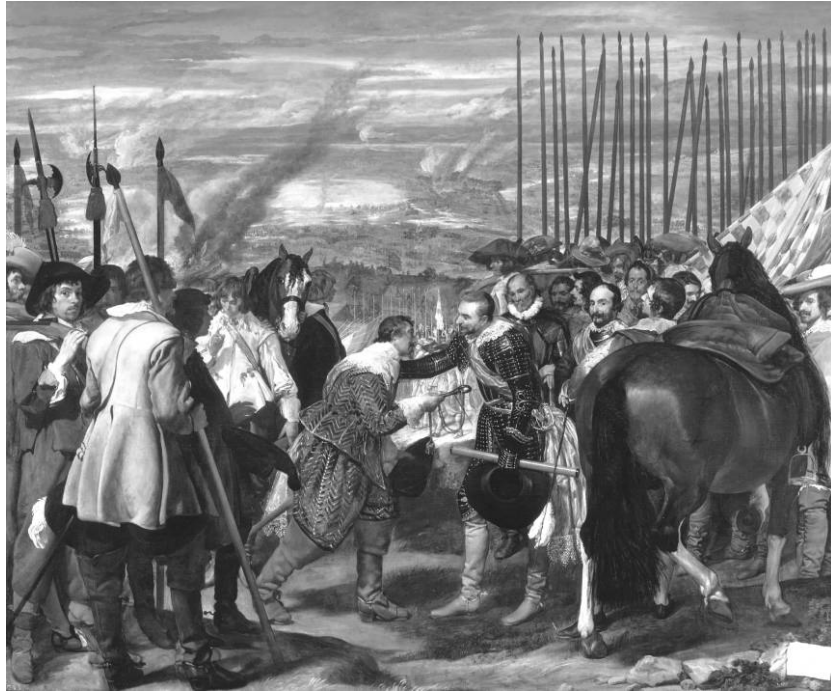
FIG. 1.— The Surrender of Breda by Diego Velazquez

event, are unsettled by their own internal complexities and by the inevitable handings-off from one informing to another. Narratives of rise and fall, history paintings of surrenders, and maps with royal seals or governmental imprimaturs alike harbor their own ambiguities and participate in complex networks of promises, oaths, agreements, signatures, treaties, prayers, and diaries. Even as these genres provide the material for the representations, demonstratives, and performatives that direct the traffic of events, their shape takings should not be reified. A general theory of the restlessness of events must account for the continuous transformations of events, as actions and interpretations unfold across time, space, diverse media, and variably receptive publics. It must, as well, be able to account for the discontinuous stopping points as events take recognizable shape as “entities.”