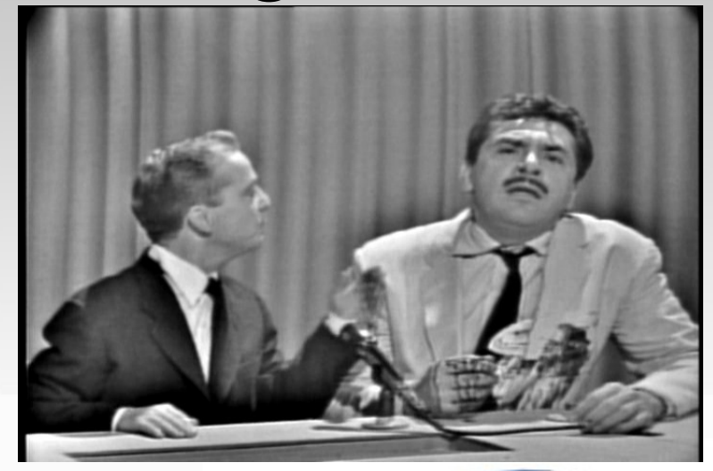
Ernie Kovacs, showmen

In the early phase of a genre, the formula and conventions that come to characterize a genre have yet to be clearly defined. As a result, this stage characterized by innovation.