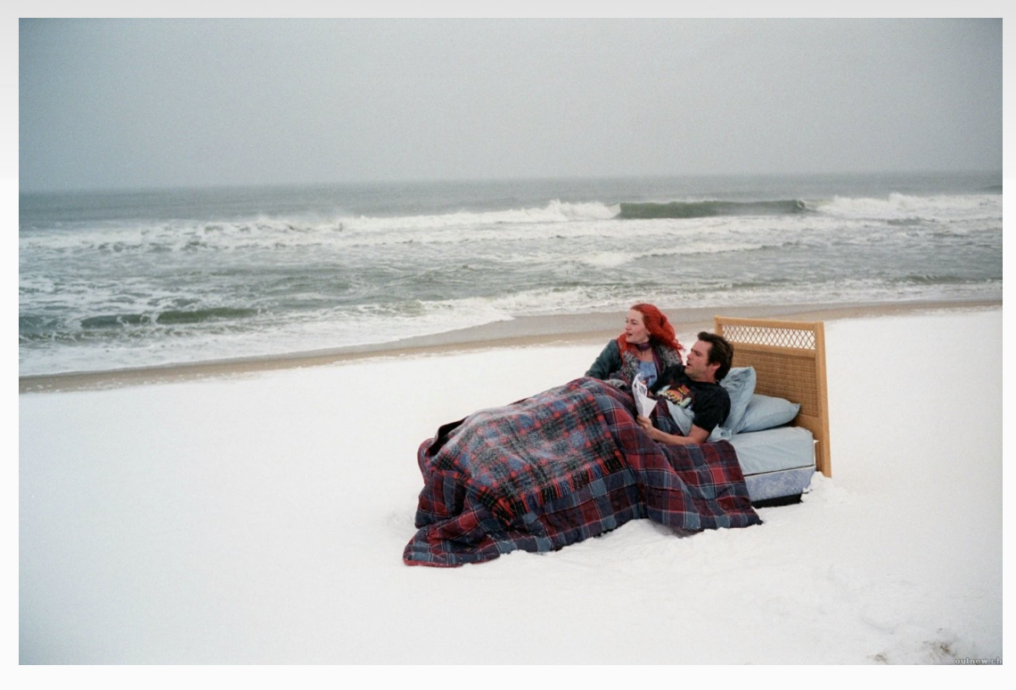
Eternal Sunshine of the Spotless Mind