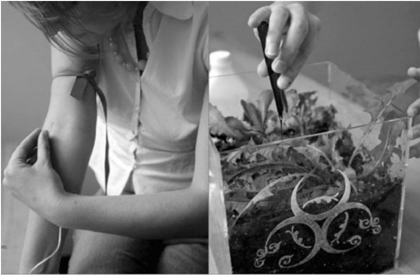
FIGURE 3. “Lifecycle of a Common Weed” by Caitlin Berrigan.

Noting that the recipient of her nurturing gesture is regarded as a “weed,” Berrigan worked to give the dandelion biographical and political life ( bios ), elevating it from the realm of bare life. “The dandelion actually has a lot to offer us even though they grow everywhere, and are killed with herbicides,” she later told us (see also Berrigan 2009). Berrigan’s art and personal medical regimen might be understood as a “microbiopolitical” intervention, calling attention to how living with microorganisms (in this case, a pathogenic virus) is caught up in discourses about how humans ought live with one another (Paxson 2008:16). Appropriating tools of biotechnology and syncretic medical traditions, she worked to create a symbolic cycle of nutrients in urban environments, on a micro local scale, in opposition to dominant institutionalized practices and global commodity chains (cf. Paxson 2008:40).