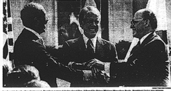
Leaders shake hands after signing pact. President Carter (left) shakes hands with Egyptian President Sadat (center) and Israeli Prime Minister Begin (right) after signing the peace treaty.