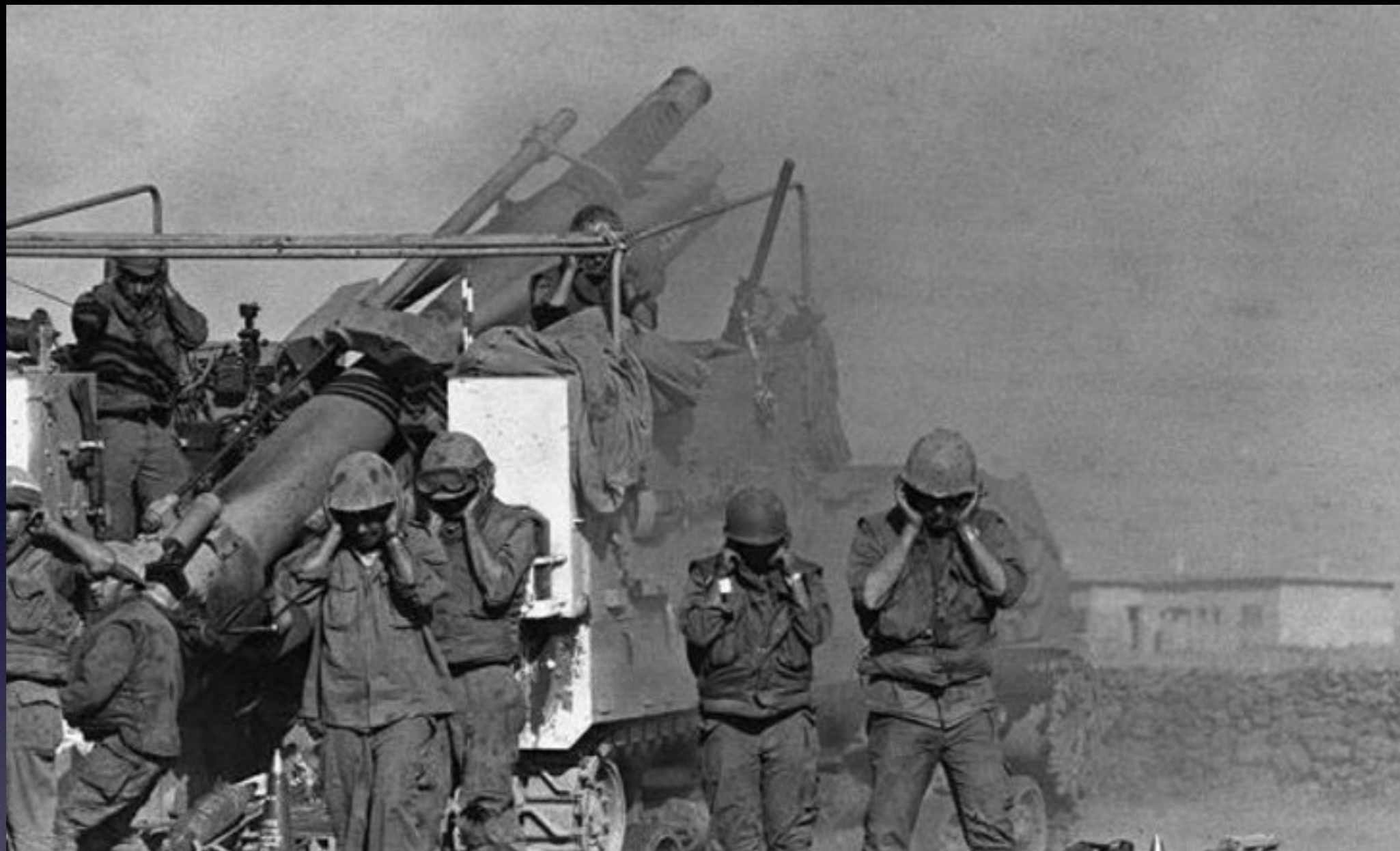
Israeli soldiers plug their ears as they fire shells from a French-made 155mm Horwitzer gun on Oct. 17, 1973 at the Syrian front lines on the Syrian Golan Heights, two weeks after the beginning of the Yom Kippur War 06 October 1973.