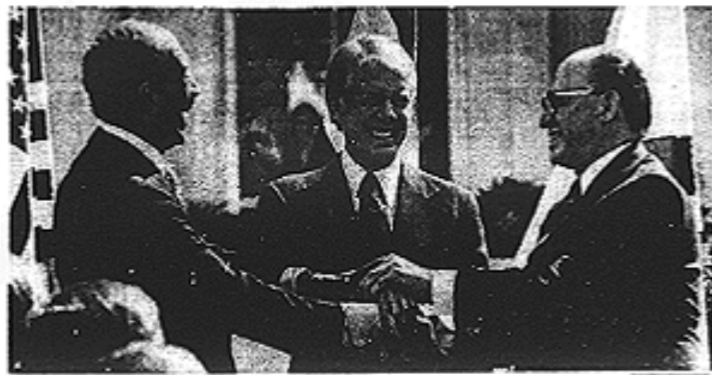
Leaders shake hands after signing pact. President Carter (left) is flanked by Egyptian President Anwar Sadat (center) and Israeli Prime Minister Menachem Begin (right).