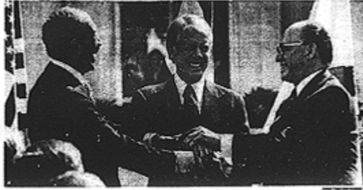
Leaders shake hands after signing pact. President Carter at left, Sadat at center, Begin at right.