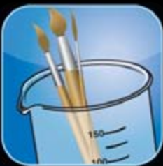
Combine the Humanities with The Sciences