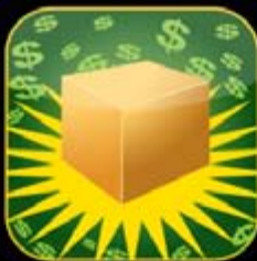
Put Products Before Profits