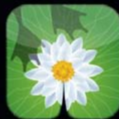
When Behind, Leapfrog