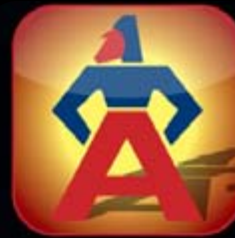
Tolerate Only "A" Players