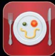
Stay Hungry, Stay Foolish