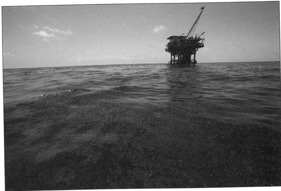
Oil from the BP spill in the Gulf of Mexico in 2010 raised political questions about deep-sea drilling. Should U.S. need for oil override environmental concerns?

Aristotle, the founder of the discipline , called politics “the master science.” He meant that almost everything happens in a political context, that the decisions of the polis (the Greek city-state) governed most other things. Politics, in the words of Yale’s Harold Lasswell (1902–1978), is the study of “who gets what.” But, some object, the economic system determines who gets what in countries with free markets. True, but should we have a totally free-market system with no government involved? A decision to bail out shaky banks sparks angry controversy over this