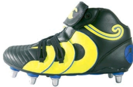
Figure 4: Canterbury of New Zealand, Moko rugby boot, 2001.

within the local market or an exoticness or recognition of the formal appeal of the motif internationally. The company's involvement with an indigenous designer looks to bolster the appropriateness of its use and, furthermore, there is no intention by the company to assert any claim of ownership over the designs or words used (acc. to the Sunday Star Times , 4 Nov. 2001).