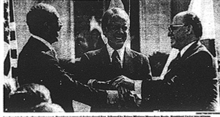
Leaders shake hands after signing pact. President Carter at right, Egyptian President Sadat at left, Israeli Prime Minister Begin in center. President Carter was smiling.