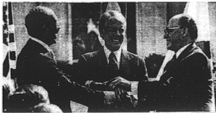
Leaders shake hands after signing pact. President Carter at right, Egyptian President Sadat at left, Israeli Prime Minister Menachem Begin. President Carter was smiling.