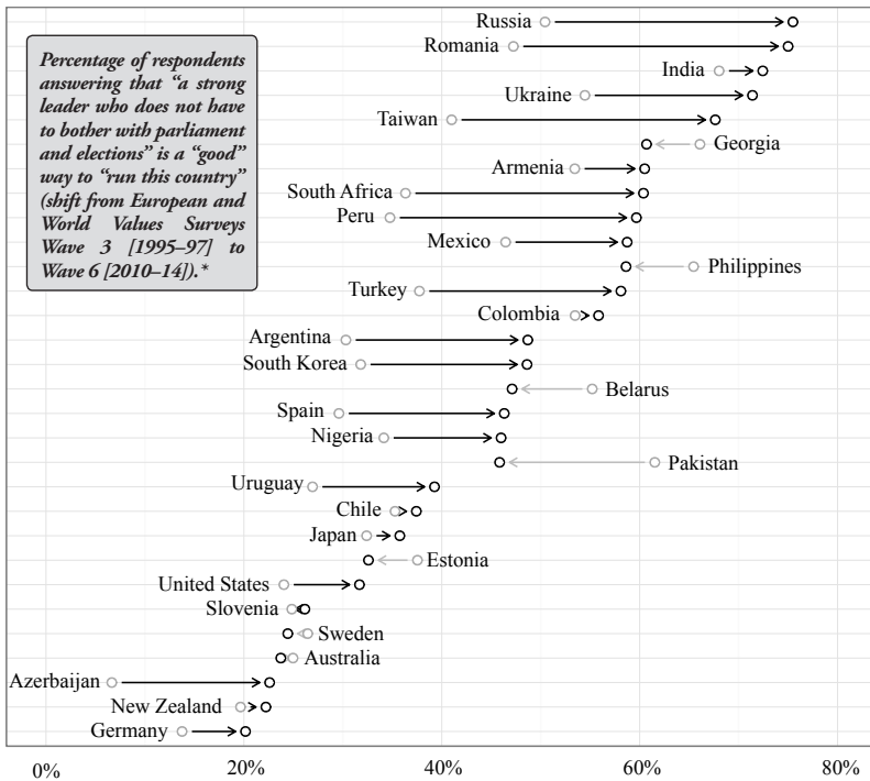
FIGURE 2—GLOBAL RISE IN SHARE OF CITIZENS WISHING FOR A STRONG LEADER “WHO DOES NOT HAVE TO BOTHER WITH ELECTIONS”