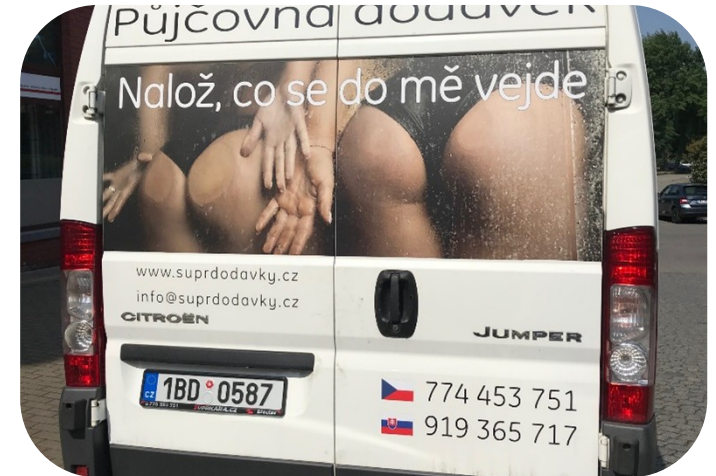
2018, 2nd place – public