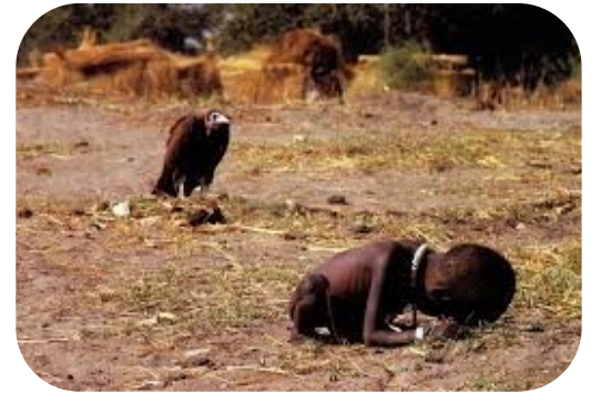
Kevin Carter, 03/1993, The vulture and the little girl, South Sudan, Pulitzer Prize