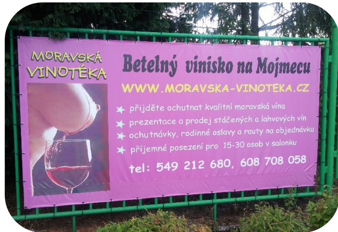
2018, winner – public