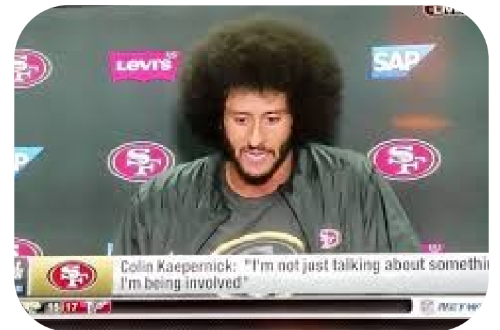
Colin Kaepernick at the press conference, 2016