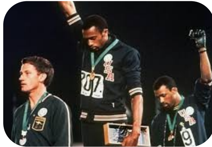
Black Power Salute, 1968