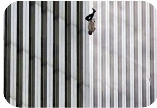
9/11/2001, The Falling Man