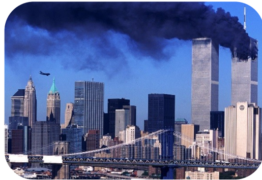
Robert Clark, 9/11/2001, United Airlines Flight 175 approaches the World Trade Center