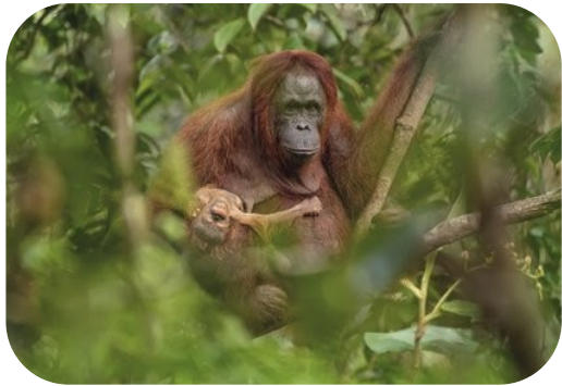
Lukáš Zeman, Czech Press Photo, 2018, Borneo, National Park Tanjung Puting, female orangutan and its dying child