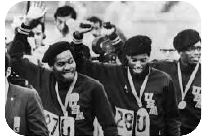
Black Power Salute, 1968