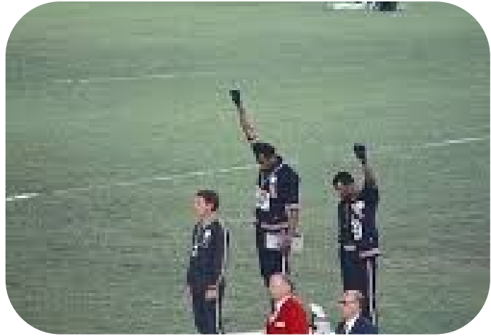
Black Power Salute, 1968