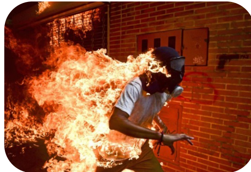
Venezuela Crisis