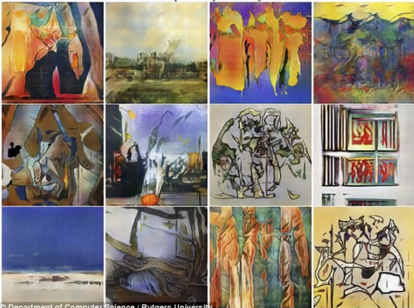
CAN: Top ranked by human subjects