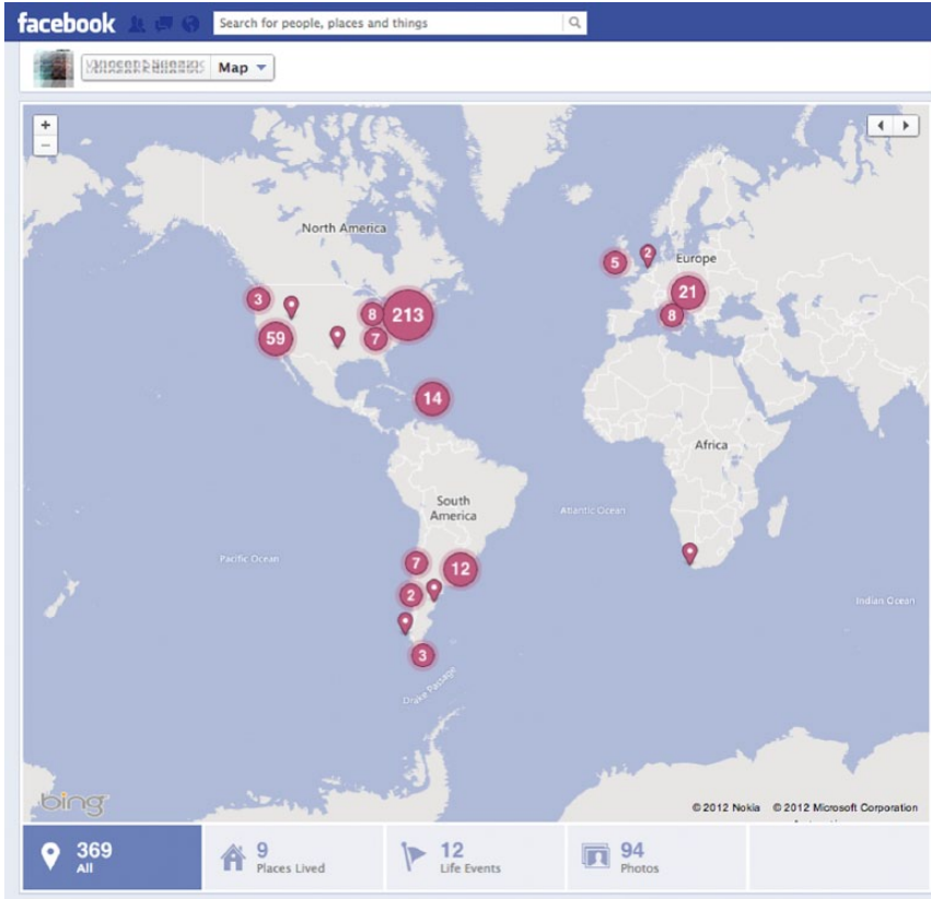
Figure 1. A user profile map on Facebook.

to address motivations for using the Facebook check-in function or identify how location-announcement via mixed use social media platforms is read and understood by participants and audiences.