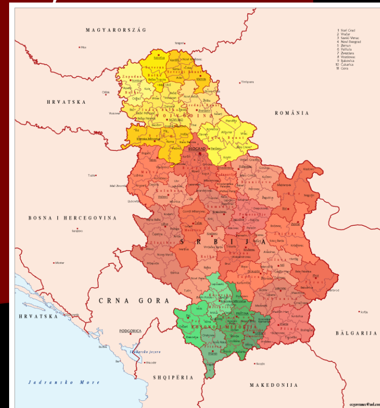
SERBIEN Politische Karte

Die Republik Serbien in ihrer Einteilung in Großgemeinden, Bezirke und autonome Provinzen