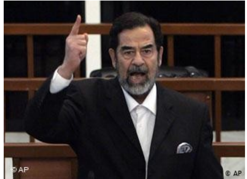
Saddam Hussein in court