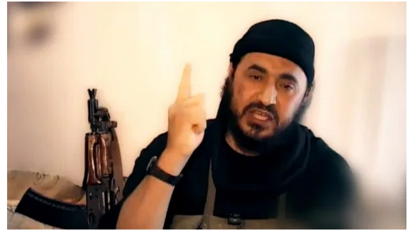
Abu Musab al-Zarqawi