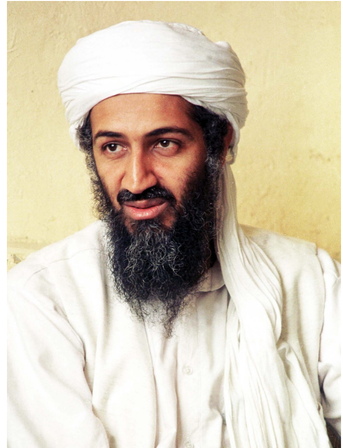
Osama bin Laden