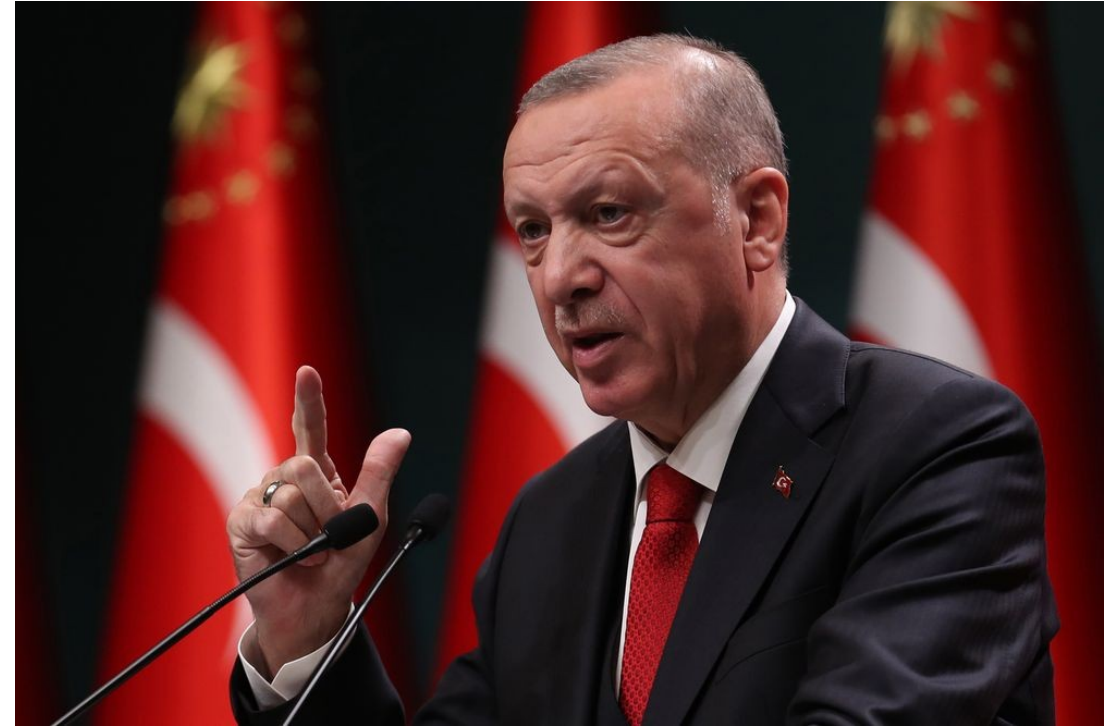
Recep Tayyip Erdoğan