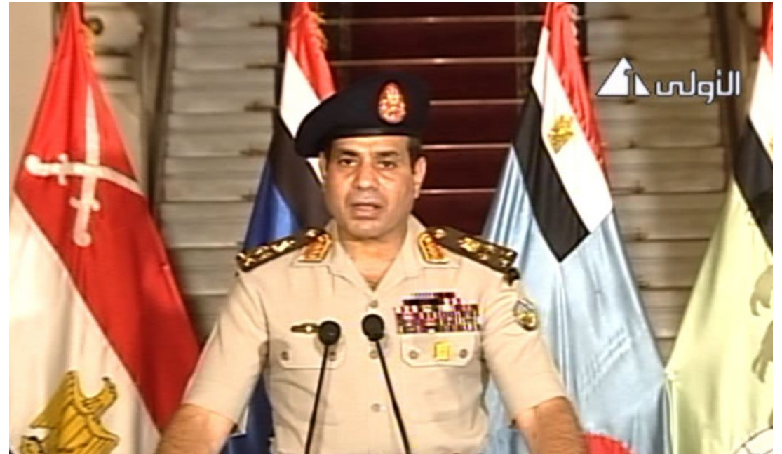
Abdel Fattah el-Sisi