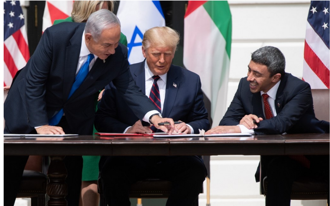
Israeli prime minister Benjamin Netanyahu, US President Donald Trump, and UAE Foreign Minister Abdullah bin Zayed Al-Nahyan