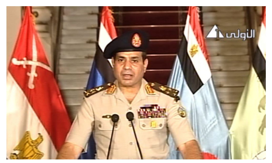
Abdel Fattah el-Sisi