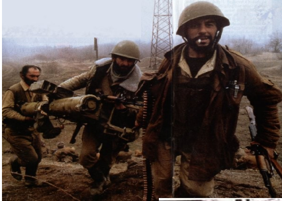
Guerillas in Nagorno-Karabakh.