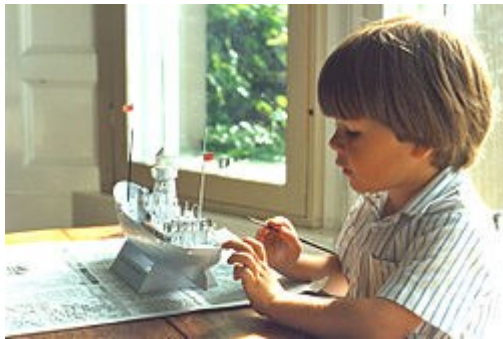
Young child, painting a model

In education , the concept of overlearning plays a role in a student's ability to achieve flow. Csíkszentmihályi [31] states that overlearning enables the mind to concentrate on visualizing the desired performance as a singular, integrated action instead of a set of actions. Challenging assignments that (slightly) stretch one's skills lead to flow. [32]