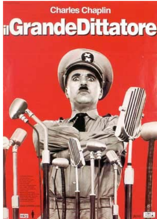
Figure 1.2. “The Great Dictator” 1940