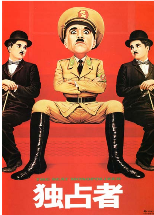
Figure 1.1. “The Seat Monopolizer” by H. Kawakita, 1976, Original! Japanese manner posters. © 2008 by Graphicsha Company.