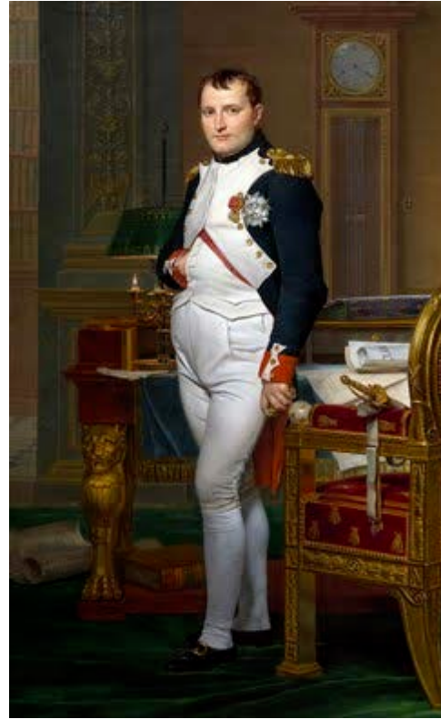
Figure 1.8. “Napoleon Bonaparte in His Study at the Tuileries” 1812 by Jacques-Louis David.