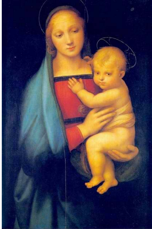
Figure 1.4. Madonna dell'Granduca , 1505 by R. Sanzio da Urbino.