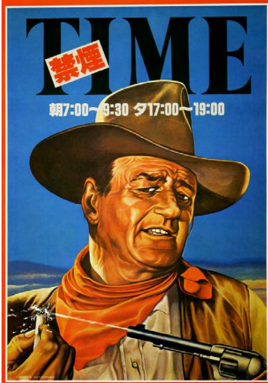
Figure 1.5. “Time for No Smoking” by H. Kawakita, 1982, Original! Japanese manner posters . © 2008 by Graphicsha Company.