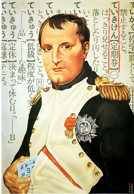
Figure 1.7. “Clearly show your train pass” by H. Kawakita, 1978, Original! Japanese manner posters. © 2008 by Graphicsha Company.