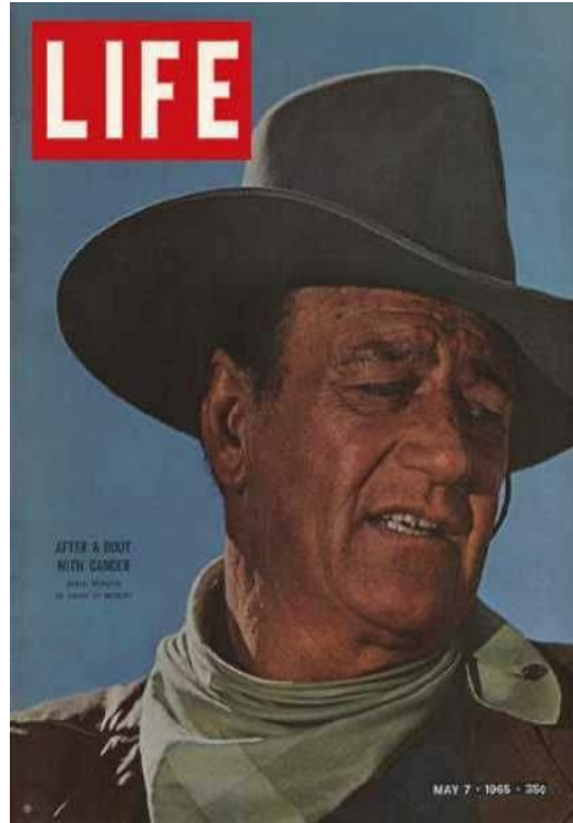
Figure 1.6. “After a Bout with Cancer” 1965 Life Magazine .