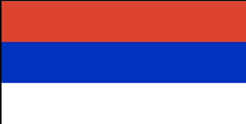
Republic of Srpska