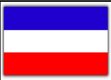
Serbia Monte Negro