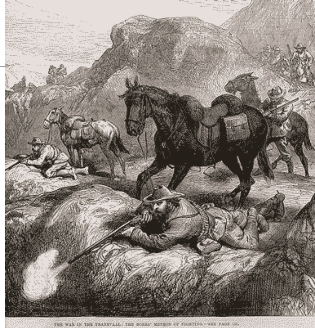
THE WAR IN THE TRANSVAAL: THE BOERS' METHOD OF FIGHTING.—SEE PAGE 15.